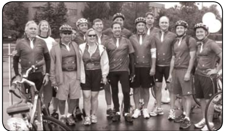
Team Siemens, winners of the 2009 Best Dressed Team Award

*Winners will be announced at the Saturday evening program.