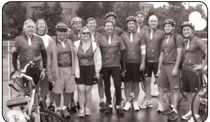
Team Siemens, winners of the 2009 Best Dressed Team Award

*Winners will be announced at the Saturday evening program.